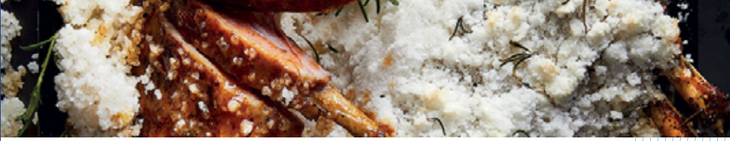
Table Sea Salt